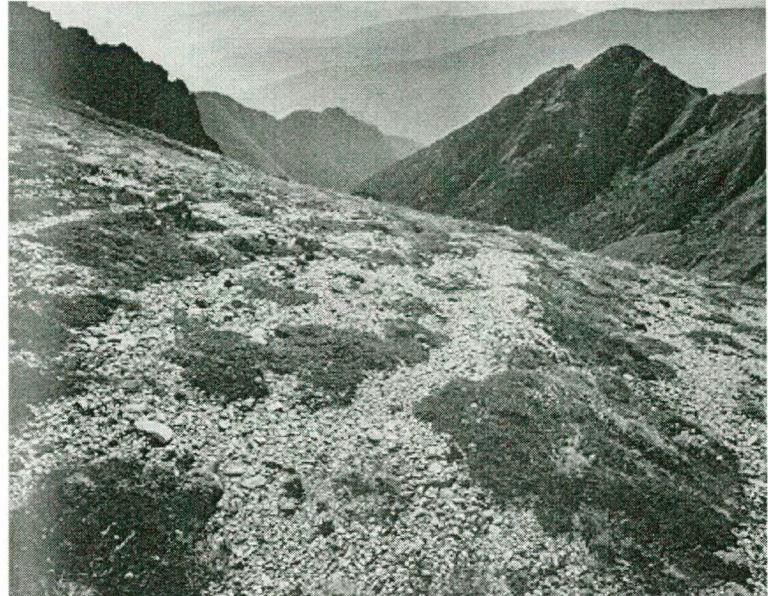
Feldmark community near Carruthers Peak showing the pattern of Epacris microphylla sens. lat. shrubs growing on a stony erosion pavement. The shrubs move slowly across the ridges because of damage to plants from wind on the windward side and layering on the leeward side.

The only confirmed vegetation type containing Feldmark Grass in Australia is feldmark. Feldmark occurs mainly on exposed ridgetops, which have little soil development and abundant fractured rock. There is little snow cover in winter because the prevailing westerly winds blow it off into lee snow patches. The absence of snow cover means that extremely low temperatures and strong winds are experienced for long periods during winter. Surface soil temperatures are high in summer and soil moisture levels are often limiting at that time. Few plant species are able to survive under these conditions. As a result, plant cover is sparse.